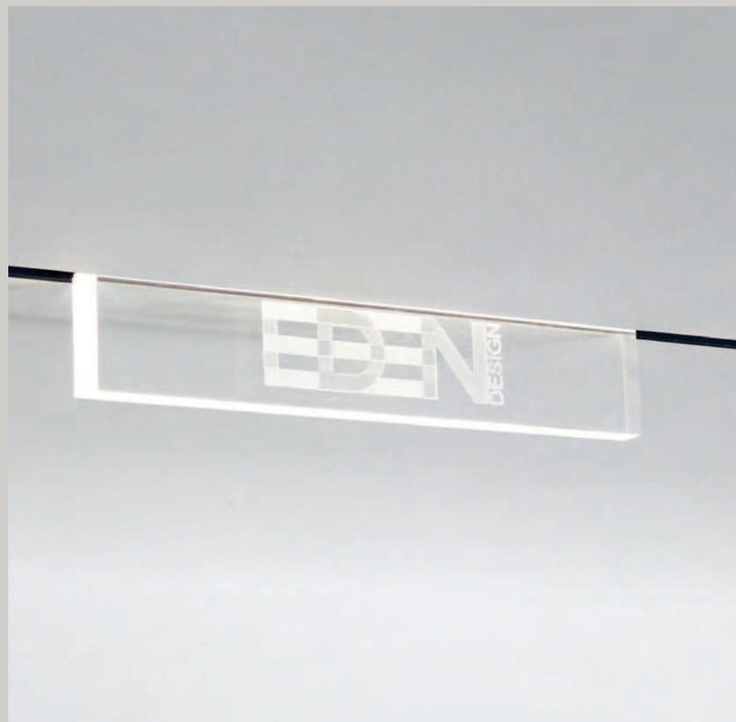
°out with solid clear diffuser with custom etched front (SCE)