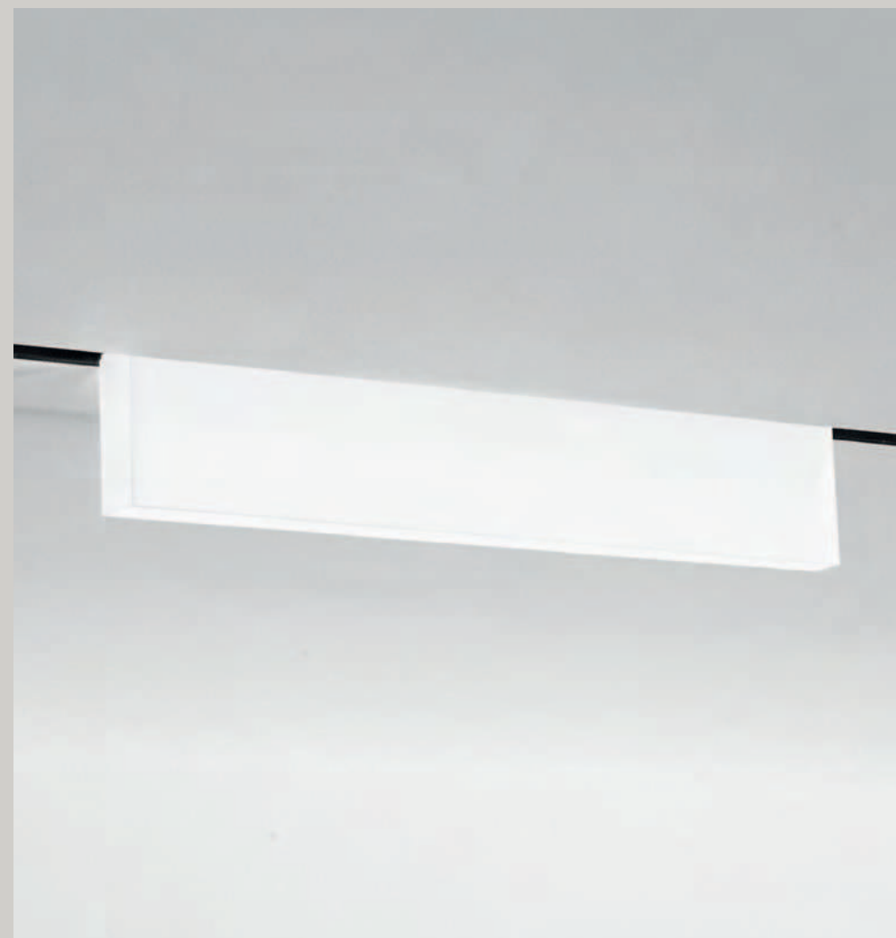
°out with solid frost diffuser (SF)